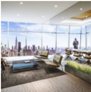
Rendering of a tower office

"These renderings of 3 Hudson Boulevard express the spirit of the design: open, gracious, connected to greenery, and filled with sunlight," Kaplan said. "They convey a stunning transformation of a large but underutilized block into a vibrant and sustainable addition to Manhattan"