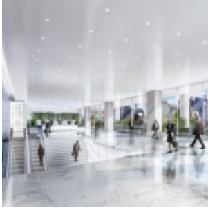
The lobby of 3 Hudson Boulevard

'twist' — the tower will also provide 360 degree views of the Hudson River, High Line, Hudson Boulevard Park, Central Park, Times Square, and the Empire State Building.