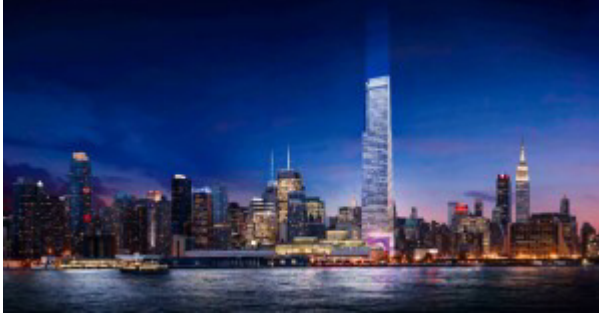
New rendering of 3 Hudson Boulevard

The Moinian Group today unveiled four new renderings for its 1.8 million square foot LEED Platinum tower, located on 11th Avenue between West 34th and West 35th Streets, which is designed by architect Dan Kaplan FAIA of FXFOWLE.